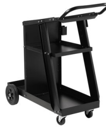
TROLLEY - AMERICA 803084