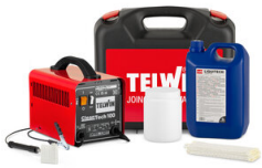
CLEANTECH 100 850000